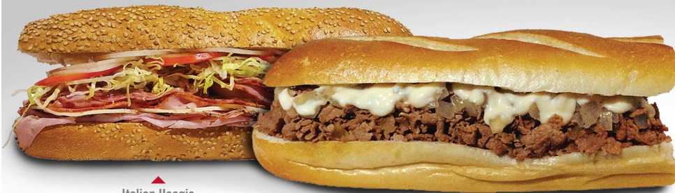
Italian Hoagie on a seeded roll

From our Philly's Best Tomato Pie to creative, made-your-way salads, we only use the best and freshest ingredients for our homemade recipes.